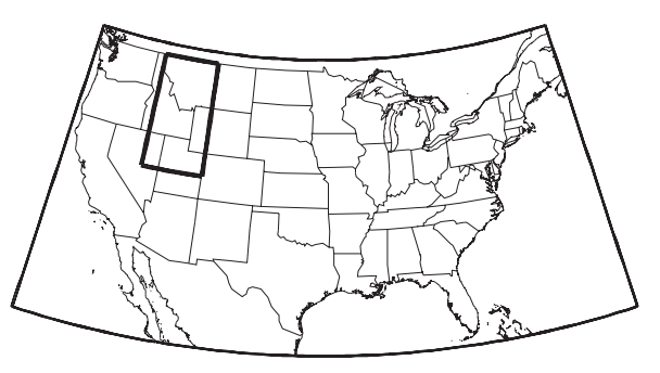
Index map showing location of study area